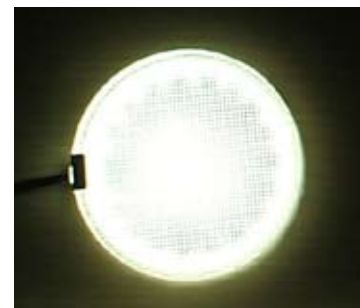
Figure 3 - Hockey Puck

With the manufacturing plant located in Markham, Ontario, Fawoo Canada provides customers with fast delivery of any customized size panel, local customer support, and our standard 2 years product warranty.